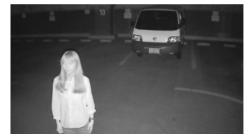
Advanced IR technology (can identify close and distant objects)