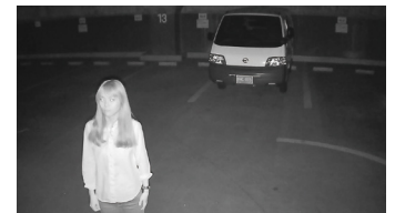
Advanced IR technology (can identify close and distant objects)