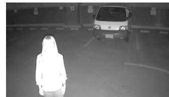
Conventional IR technology (cannot identify close objects due to overexposure)